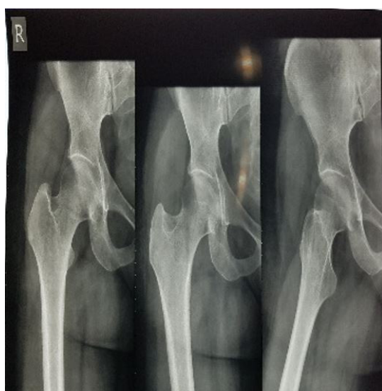
Figure 2. Pelvic X-Ray in favor of femoral neck fracture