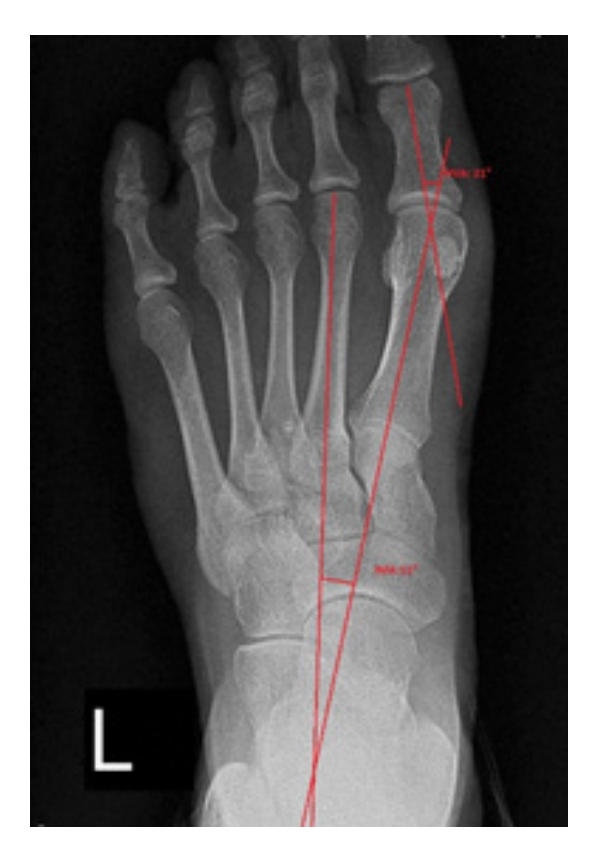
Figure 1. Before KT (IMA: 11 HVA: 21)

The MOXFQ assessment showed significant differences between KT and PH in none of the interval assessments, including baseline, immediately following the interventions and within two months. Similar to pain, the MOXFQ improved by the time in general (P-value<0.001); however, this trend was not dependent on the type of the intervention (P-value=0.84), and the comparison of the in-