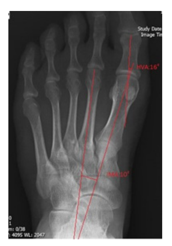
Figure 2. After KT (IMA: 10 HVA: 16)