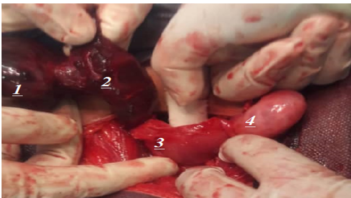
Figure 2. Right adnexal torsion observed during laparotomy on a child presenting with acute-severe and constant abdominal pain. The numbers show (1) right ovary (2) right fallopian tube (3) uterus and (4) left normal ovary.

Acute OT is an uncommon but critical issue in children. It may present in a normal ovary devoid of a primary mass. It is more likely to happen if the person displays traits such as