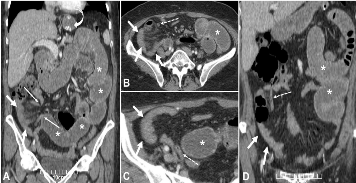
Figure 1. CT scan of the patient in coronal (A and D) and axial (B and C) views. Collapsed herniated loops of distal ileum are seen at RLQ (arrows) with mild adjacent mesenteric fluid and fat haziness associated with upstream small bowel dilatation (asterisks). An elongated loop of the appendix (dotted arrows) is noted arising from a highly located cecum extending down to the sac of hernia on the right side of the pelvis without appendiceal wall thickening. Two focal areas of luminal narrowing with beak-like appearance (thin arrows) are depicted in the distal ileum at the neck of the internal hernia with dilated upstream and collapsed downstream ileum showing a closed loop appearance. Signs of previous gastric sleeve surgery are seen in the upper abdomen (curved arrow).

with oral agents. Past medical surgeries consist of cesarean section (15 years ago), cholecystectomy (15 years ago), sleeve surgery (14 months ago), and hemorrhoidectomy (15 years ago). On the physical exam, the abdomen was soft, and only diffuse tenderness particularly periumbilical was observed. The vital signs were within normal limits. There were no other abnormal findings in physical examinations. Considering our more probable differential diagnosis (i.e., intestinal obstruction/perforation/ appendicitis, and peptic ulcer), she underwent imaging studies.