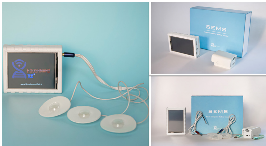
Figure 1. The SEMS-HIOT device

vice, named SEMS-HIOT developed by the Health Technology Development Centre of Babol University of Medical Sciences in cooperation with Hooshmand Teb company (Iran) was evaluated. The SEMS-HIOT device (Figure-1) is a portable device that can monitor cardiac features and send them via the internet (through a sim card) and/or wireless to the medical system record center and medical staffs.