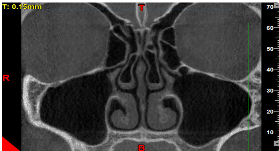
Figure 1. CBCT showing pneumatization of the middle concha. Note the pneumatization and radiolucency in the middle concha, which were detected by scrolling the coronal view.

As the current literature highlights the importance of the OMC in maxillary sinus drainage, yet fails to thoroughly investigate the impact of concha bullosa on the infundibulum length and ostium height, particularly in the Iranian