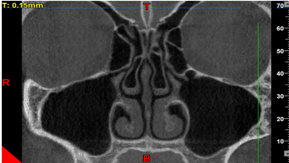
Figure 2. Measuring the infundibulum length

population, we aimed to bridge this knowledge gap by examining the relationship between concha bullosa and these anatomical parameters using CBCT in a sample of Iranian patients. Moreover, our study novelly explores the effect of concha bullosa on the maxillary sinus drainage system in this population, providing new insights into the potential mechanisms underlying maxillary sinusitis, which have not been fully elucidated in previous studies.